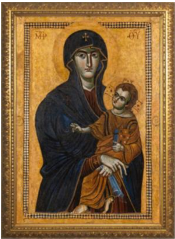
The image of Our Lady. Salus Populi Romani , 'Protectress of the Roman People', is normally kept in the Papal Basilica of St Mary Major, and is very dear to our Holy Father Pope Francis.

O Mary, you shine continuously on our journey as a sign of salvation and hope. We entrust ourselves to you, Health of the Sick, who, at the foot of the Cross, were united with Jesus' suffering, and persevered in your faith. Salus Populi Romani , you know our needs, and we know that you will provide, so that, as at Cana in Galilee, joy and celebration may return after this time of trial. Help us, Mother of Divine Love, to conform ourselves to the will of the Father and to do what Jesus tells us. For he took upon himself our suffering, and burdened himself with our sorrows to bring us, through the Cross, to the joy of the Resurrection. We fly to your protection, O Holy Mother of God; do not despise our petitions in our necessities, but deliver us always from every danger, O glorious and blessed Virgin. Amen! Alleluia!